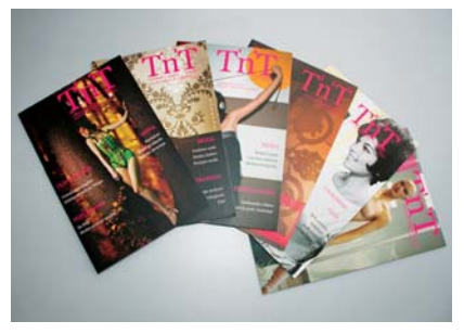
Students' magazine T'n'T

and sports section which regularly participates at technical faculties' competitions. We are not the best ones, but always the winners in fair play. Students are also given an oportunity to participate in scientific reaserches for which they were often aworded. Students of design courses regularly organise fashion shows and exibitions. There well-received project was the one of complete costume design and construction for the opera The Magic Flute by W.A. Mozart, performed at The Croatian National Theatre in Zagreb.