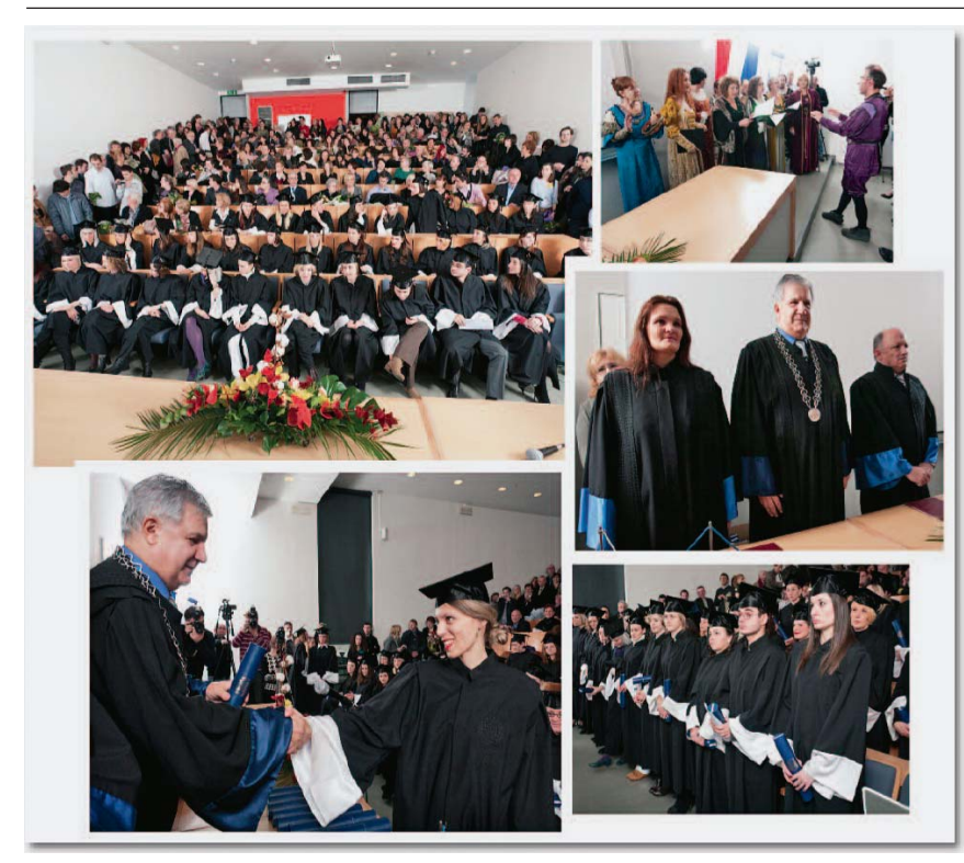
Bachelor of science graduation ceremony at the Faculty of Textile Technology in Zagreb

proach to solving problems. They are also qualified to design, organise and lead the processes in textile companies in all parts of textile technologies. On the other hand, they become competent and able to estimate art and design values of a product and to give suggestions for improvements in this aspect of production.