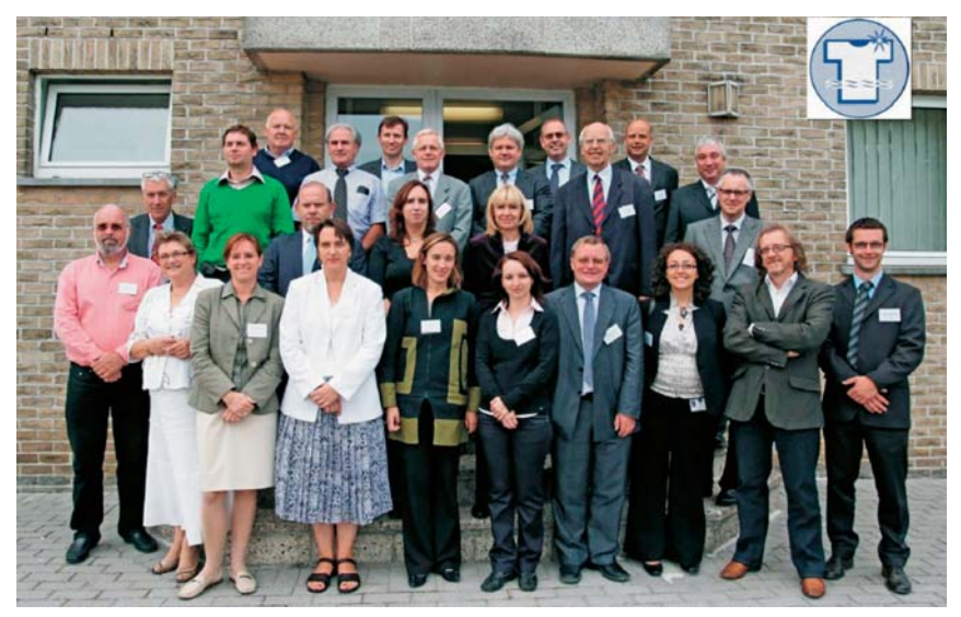
Kick-off Meeting of the SMILES Consortium at the head office of project coordinator FBT in Brusseles (EU), 2007

Throughout more than a decade 17 bilateral projects have been carried out by eminent scientific and professional organisations from the world of textile (Austria, Belgium, Hungary, Slovenia, Great Britain and Serbia). In the strategy of textile and clothing economy development of Europe un-