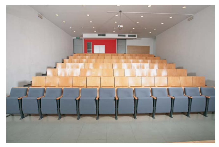
Faculty of Textile Technology inside

The departments, although not all equally large and equally old, are equally important parts of the Faculty